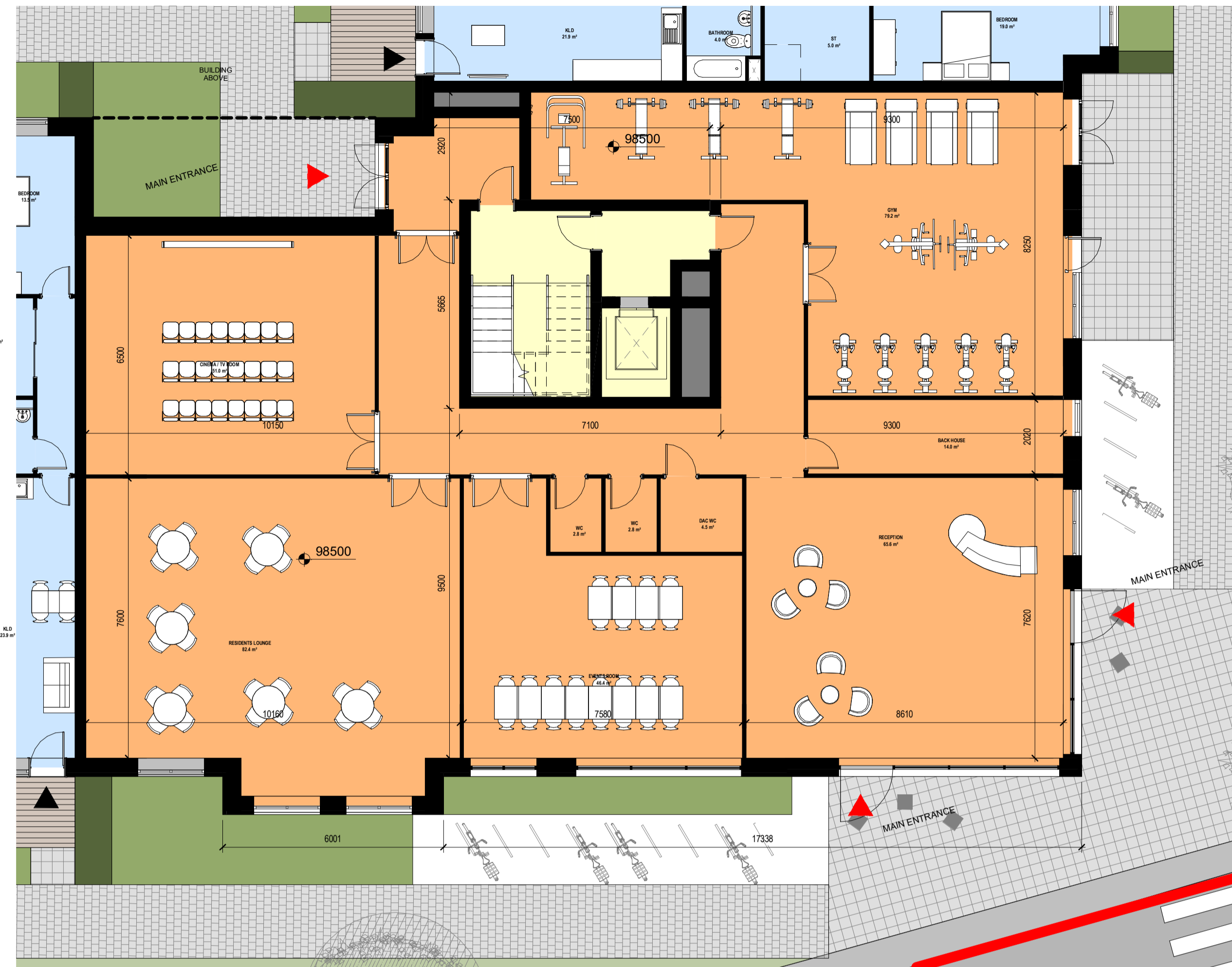
1 L00_Ground Floor Amenity space 1: 100