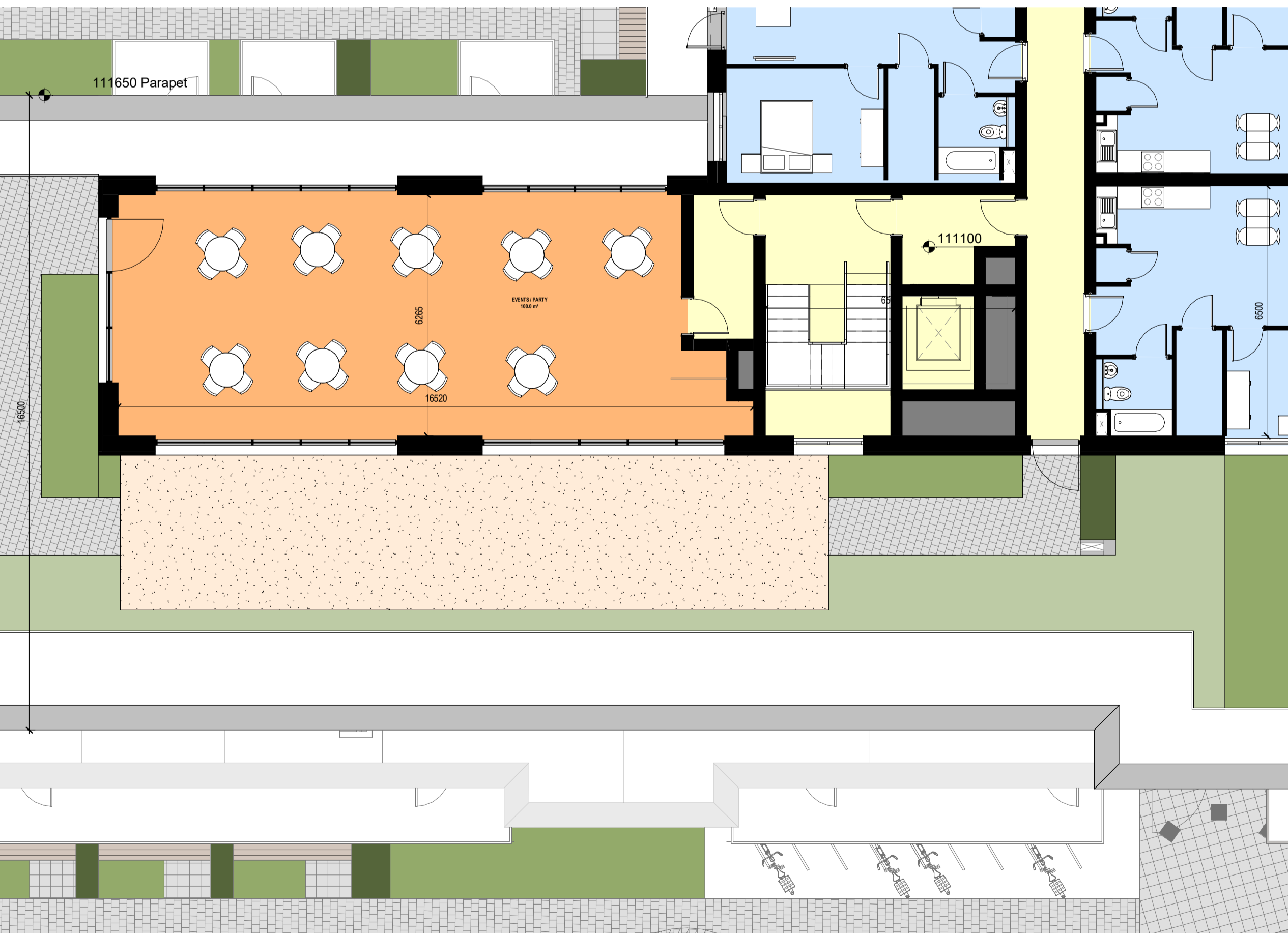
2 L04_Fourth Floor Amenity Space 1: 100